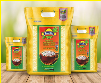
PREMIUM 1121 BASMATI RICE