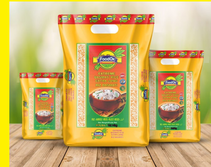
EXTREME 1121 BASMATI RICE