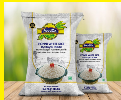
PONNI WHITE RICE