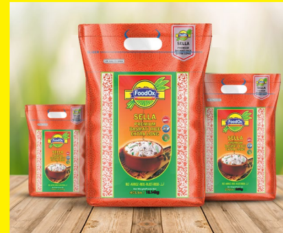
SELLA PREMIUM BASMATI RICE