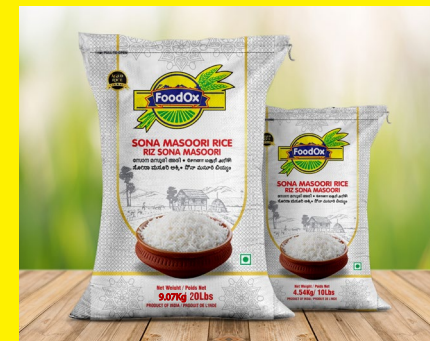
SONA MASOORI RICE