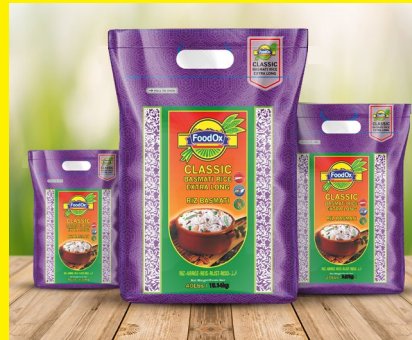
CLASSIC BASMATI RICE